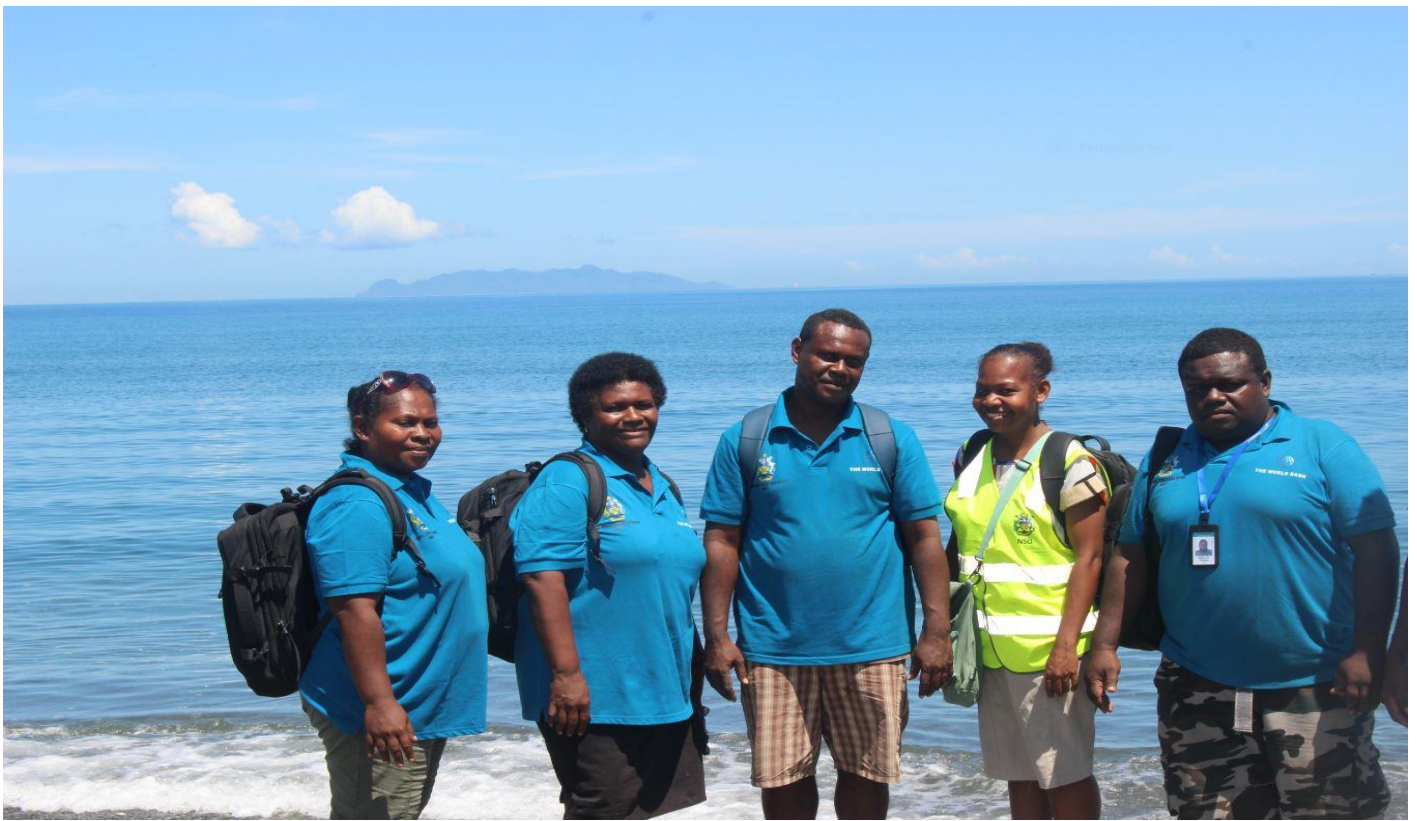
NEEC-2024: GUADALCANAL TEAM DEPLOY FOR FIELD ENUMERATION.