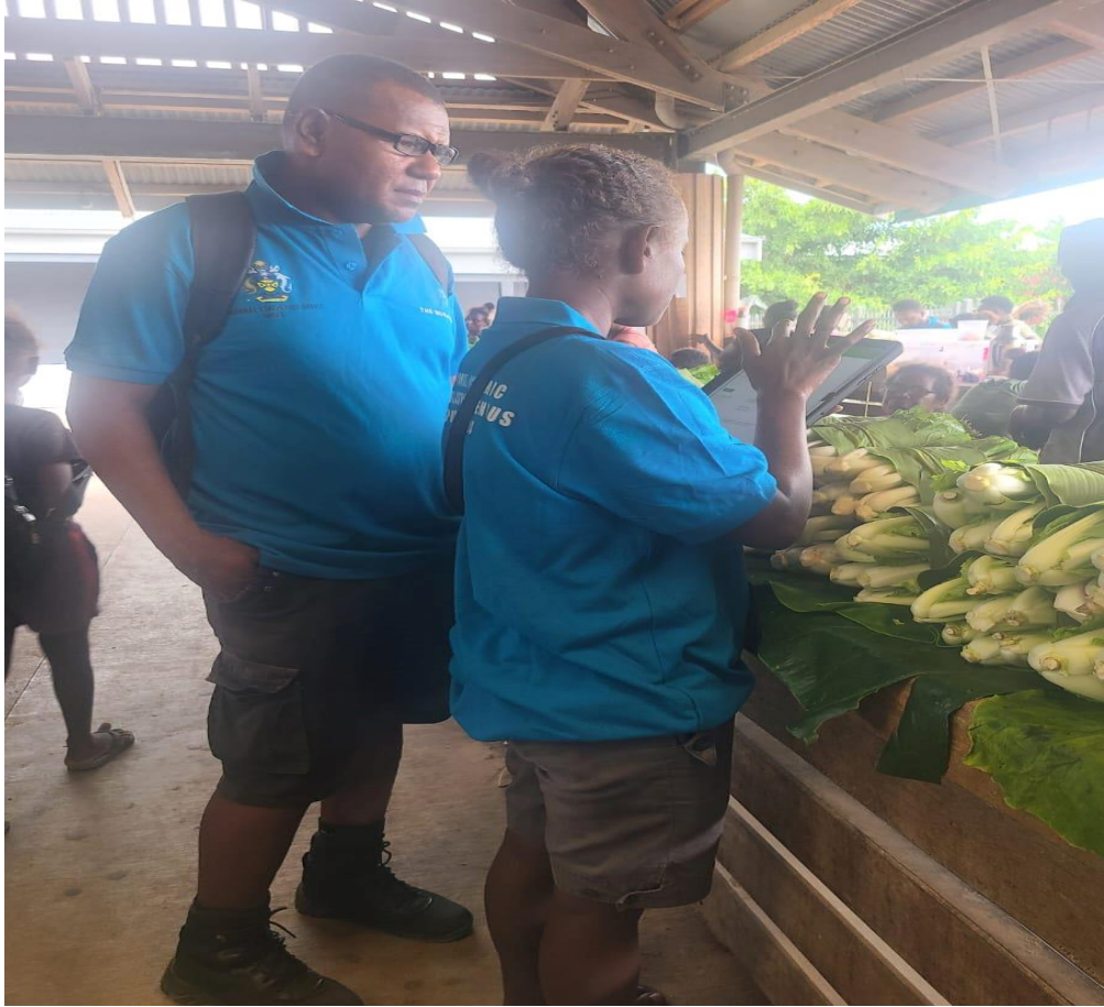
Western NEEC Team, proceed with their Enumeration @ GZIO Market.