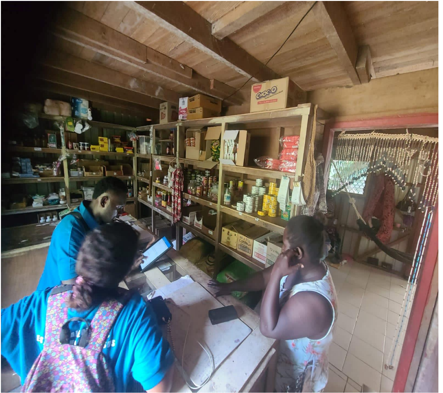
NEEC-2024-Choiseul Team Enumeration underway.